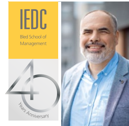
The IEDC Slovenia Bled School of Management, founded in 1986 as the first management school of its type in Central and Eastern Europe, is one of Europe’s leading international management development institutions.

True innovation occurs when nonprofit management strategies successfully align individuals’ intrinsic values with organizational goals, creating a resilient framework for long-term community transformation.”